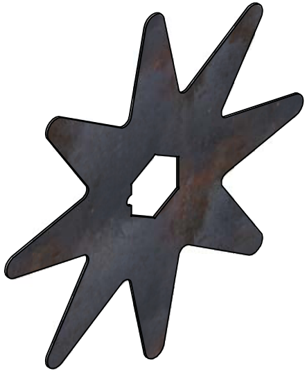
R5189 SPIKER BLADE 8 POINT (T39270 )

WARNING! Before commencing any work on the machine, raise unit to a suitable working height, secure with chains and/or blocks while working underneath or around unit.